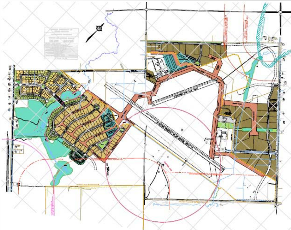
West Capital Airpark Land Use Plan

The West Capital Airpark appeals to pilots and frequent users of aviation services, as well as those wishing to live in a secure, upscale community. It attracts businesses with corporate planes and businesses that provide aviation products and services. Many developments post bold claims of unique communities that turn out to be nothing more than market hype. The West Capital Airpark, on the other hand, truly is one of a kind.