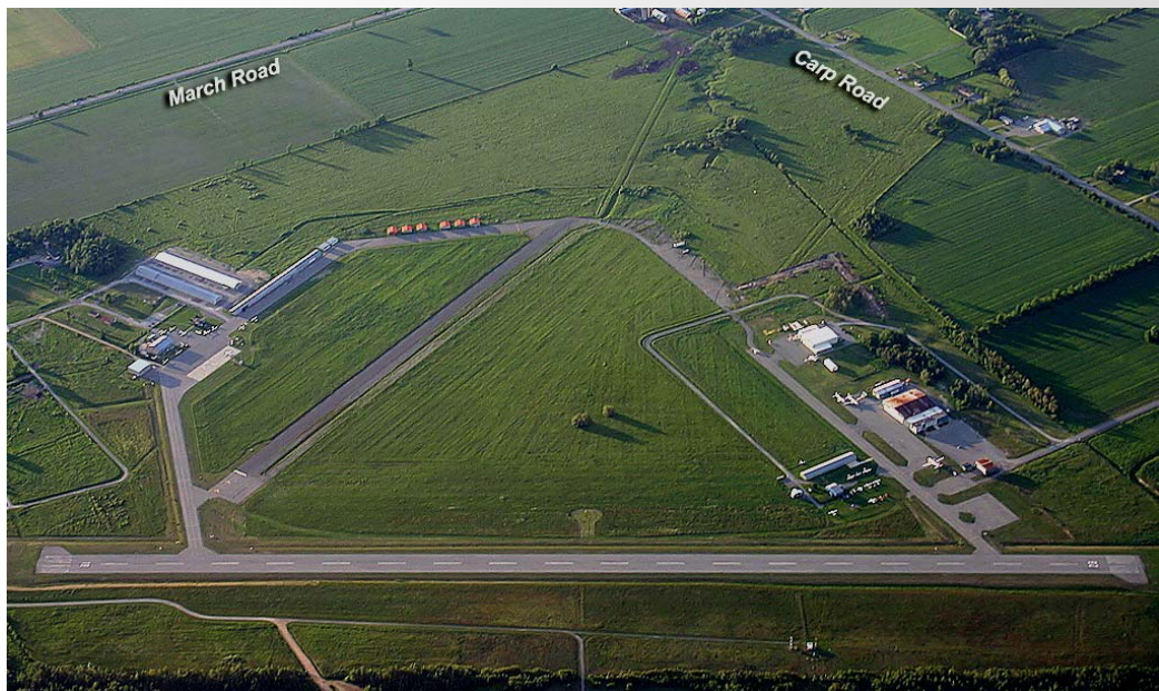
The Carp Airport Lands Today

The Carp Airport was built as a military training airfield during World War II. Left to civilian use after the war, it has been used primarily for recreational fliers; however a small number of commercial enterprises including Bradley First Air and Helicopter Transport Canada based their operations here.