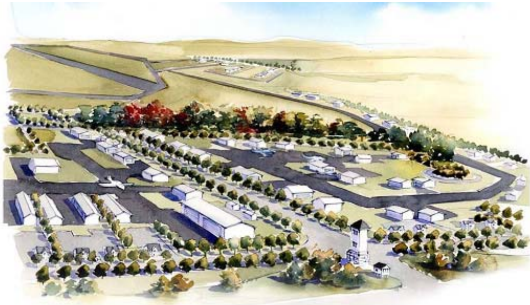
Full Service General Aviation Airport:

While the Carp Airport is viable today, the existing airport infrastructure is being upgraded. The new Fixed Base Operation (FBO) provides fuel and has the appropriate amenities to service our market of high-profile executive, government, sports, and entertainment travelers.