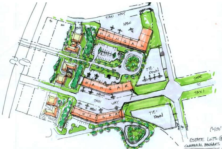
Estate Lots and communal hangars

While new to Canada, there are over 600 residential Fly-In communities in the United States. Many are in the northern states with climates similar to Ottawa. The West Capital Airpark is unique in that it also includes an Aerospace Business Park creating a community where people live, work and play.